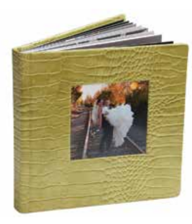
shown with Photographic Cameo Cover