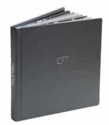
shown with Spine & Monogram Imprinting